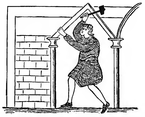
EARLY MASON'S AXE, FROM "ABLFRIC'S ANGLO-SAXON PARAPHRASE OF THE PENTATEUCH." COTTON M.S. BRITISH MUSEUM, 11TH CENTURY.

use of it, and without a chisel, the old Norman builders were able to carve out those zigzag mouldings over doorways seen at Waltham Abbey, and Durham and Peterborough Cathedrals, which are now known as "axe-work." The other form of gavel used in Masons' Lodges resembles a big hammer with a long claw to it, and this type is also seen in some drawings on old MSS. representing mediæval builders.