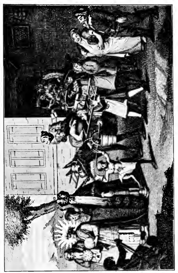
"THE CORNOGONS AND FREEMASONS"-BY HOGARTH