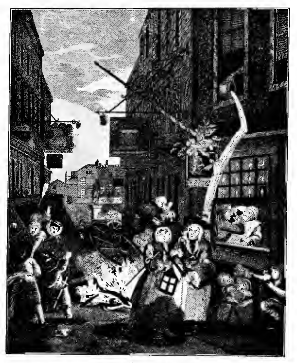
" NIGHT "-BY HOGARTH.